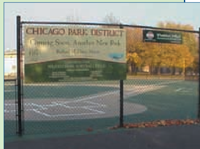
California Park Wheelchair Softball Field

over the summer and they gained valuable experience in our Fitness Center as well as at the sports and recreation programs they attended with our athletes. The Cubs finished their season in fourth place at the National Tournament. We just wrapped up our annual waterskiing event and had more than 45 people with disabilities enjoy the experience in Twin Lakes, WI. ❁